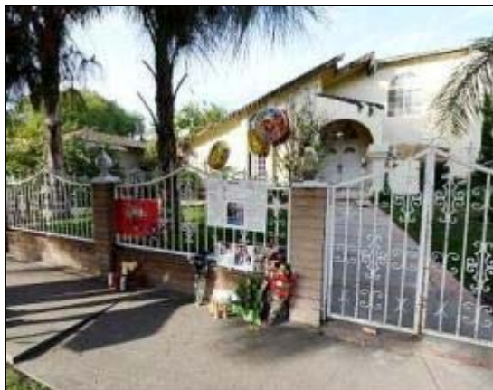
A makeshift memorial in front of the home on Devonshire St. in Northridge where the tragic quadruple homicide occurred. Police and Building & Safety Dept. officials believe the home was an unlicensed boarding facility.

In response to the quadruple homicide at an unlicensed boarding house in Northridge, I am holding a special meeting on Monday, Dec. 10 of my Public Safety Committee to discuss the need to advance my Community Care Facilities Ordinance (CCFO).