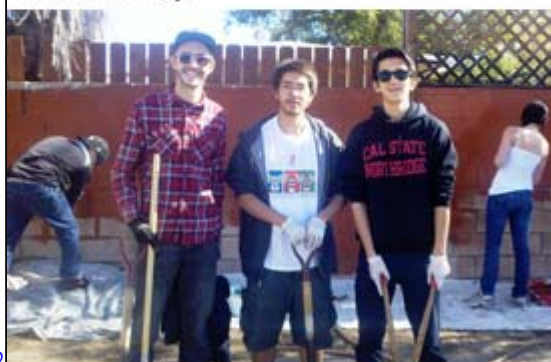
Above: Northridge South Neighborhood Council volunteers re-painting a block wall in Northridge.

(213) 473-7012 and email us at Councilmember. Englander@lacity.org