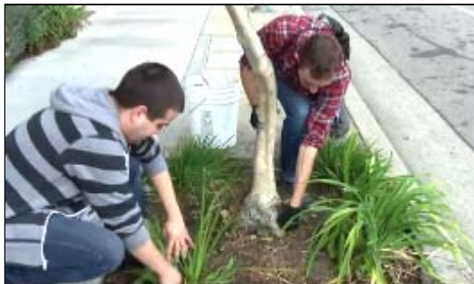
Volunteers with Northridge Sparkle Campaign working on one of their past beautification projects.

Saturday, Nov. 10 9:30 am Home Again Rescue Mission 8756 Canby Ave. Northridge