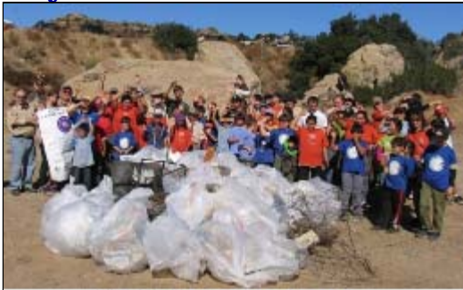
Annual Boy Scouts Stoney Point Park Clean-Up Saturday, Oct. 20

Join the Cub Scouts Troop 921 and Venture Crew 921 for their 7th Annual Stoney Point Clean-Up effort and help keep this wonderful nature area and recreational resource clean and beautiful for all. Volunteers will be clearing the numerous walking trails around Stoney Point of dried brush, trash, broken glass, and debris to make the trails more attractive and "user friendly."