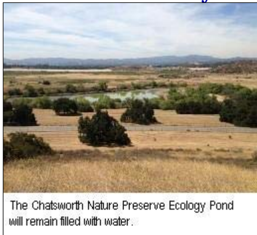
The Chatsworth Nature Preserve Ecology Pond will remain filled with water.