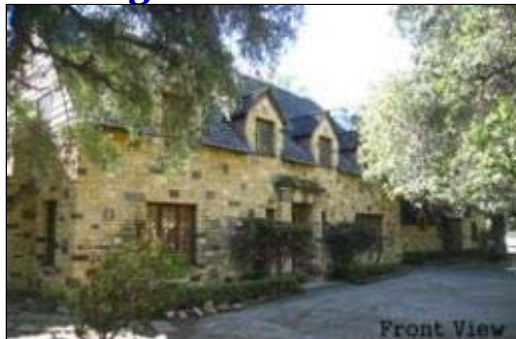
The Oakridge Estate on Devonshire St.

Join the Oakridge Estate Park Advisory Board for its quarterly meeting coming up on Thursday, Sept. 20.