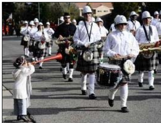
Granada Hills Holiday Parade

Bring your family to enjoy this community parade, running down Chatsworth St. from Petit Ave. to Zelzah Ave., and then south down Zelzah to Kingsbury St. The theme is "Winter Wonderland," and the Grand Marshall will be Shirley Jones who starred in the classic TV show The Partridge Family. There will also be hundreds of