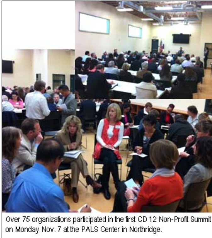
Over 75 organizations participated in the first CD 12 Non-Profit Summit on Monday Nov. 7 at the PALS Center in Northridge.